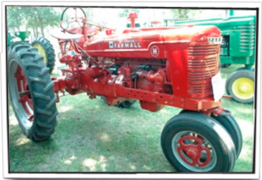
Picture Taken at the 2013 show

I nternational-Harvester was formed in 1902 by the merger of five companies. McCormick Harvesting Machine Company and Deering Harvester Company were the principals. Hart-Parr became part of Oliver Farm Equipment Company in 1930.