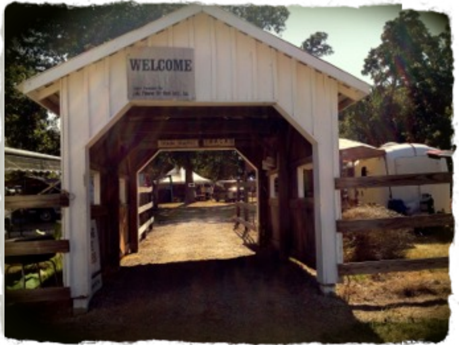
Picture Taken at the 2012 show